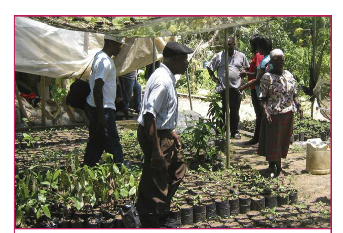
The Pencar Local Forest Management Committee in Jamaica maintains a nursery to provide the Forestry Department with seedlings for reforestation.