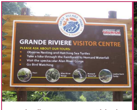
Turtle Village Trust partners with local communities in Grande Riviere and other "turtle villages" in N.E. Trinidad and S.W. Tobago.