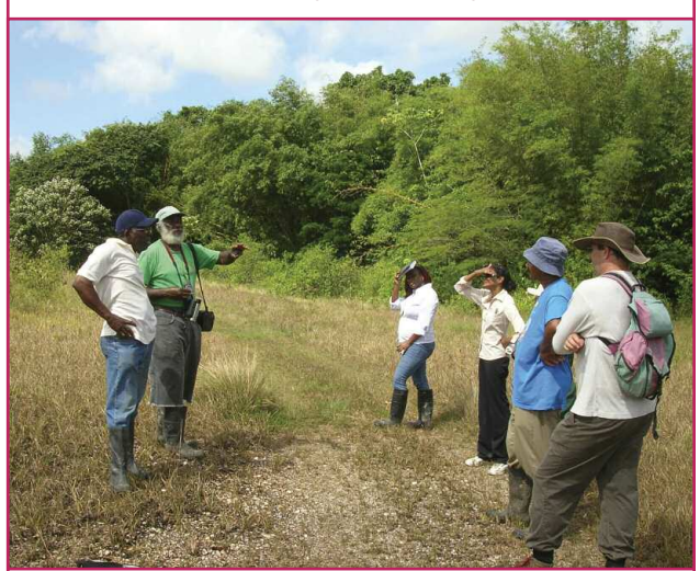
Stakeholders worked together in the field to plan how to manage the Aripo Savannas.