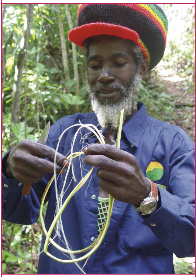
Resource users in rural communities have skills and knowledge that they can contribute to building sustainable livelihoods.