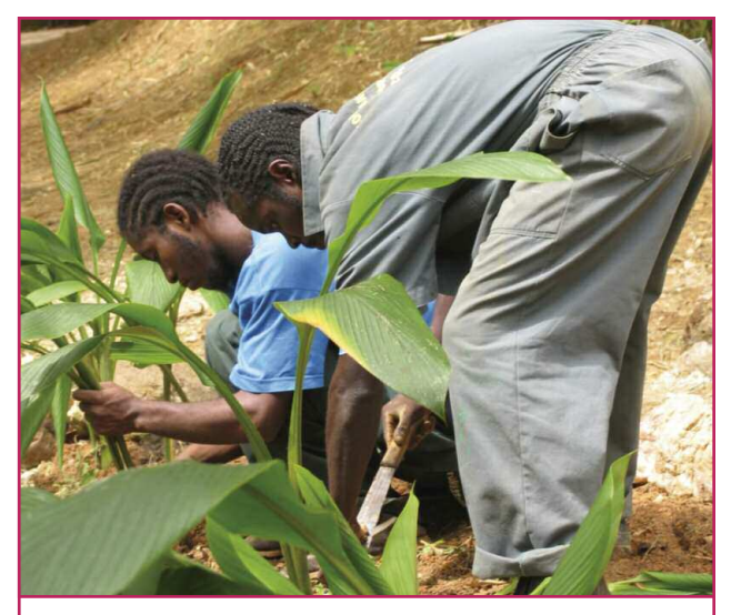
Members of the Fondes Amandes Community Reforestation Project planting in the Fondes Amandes watershed in north Trinidad.

Community participation in natural resource management cannot be effective without an enabling policy environment, not just in areas with obvious linkages such as land use planning, land tenure, agriculture, forestry and fisheries but also in terms of those relating to finance and economic development, social development, community development, civil society capacity building, and heritage