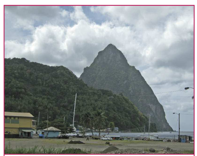
The breakdown of the institutional arrangement for communitybased management of Gros Piton tours has enabled a private entrepreneur to take over and reduced the community's involvement in decision-making and benefit-sharing.

For the purposes of this brief, a financially sustainable CBO is considered to be one that sustains itself through a diversified fundraising strategy (i.e. not over-dependent on a single source but that may include grant funding), which