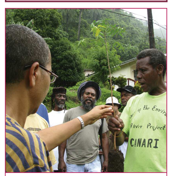
Partners of the Environment, in Saint Vincent, is a community organisation that is hoping for continuing support from its mentor as the group builds its capacity to operate sustainably.