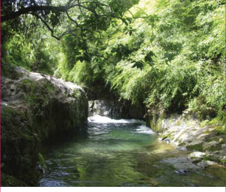
The Ebano Verde protected area in the Dominican Republic managed by the CBO, Progressio.