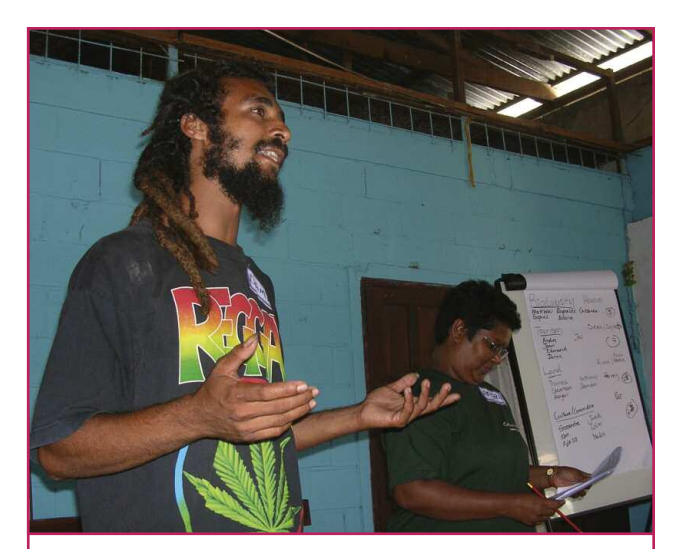
People in communities surrounding the Aripo Savannas were given the opportunity to express their ideas and needs as part of the management planning.

This presents a number of challenges even in a context such as the development of the Jamaica LFMCs where broad community engagement has been enshrined in the project design from the outset (see Box 5). These can be compounded by the fact that the support agencies may be sceptical of, or lack the requisite skills to conduct, such participatory processes. However, while effective community engagement of this kind will generally be a lengthy and iterative process, the livelihood and conservation benefits can be significant, including the fostering of relationships that improve the sustainability of the desired outcomes (see Box 6).