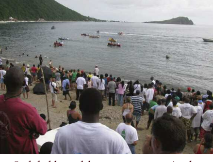
Stakeholders celebrate at a community day in the Soufriere Scotts Head Marine Reserve in Dominica, managed by a multistakeholder committee involving government, private sector, and community groups.

giving CBOs 'risk capital' in the form of small grants (US$1500-4000) to pursue small scale projects or capacity building activities, with either informal or formal mentoring. As illustrated by the example in Box 7, the results have outstripped those achieved from much larger investments and have created relationships that are contributing significantly to long-term sustainability.