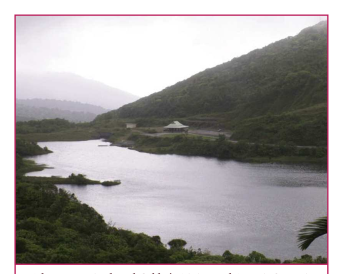
The community-based Calder's Dining and Aquatic Sports is conducting tours and managing the Visitor Centre in the famous Morne Trois Pitons World Heritage Site in Dominica.